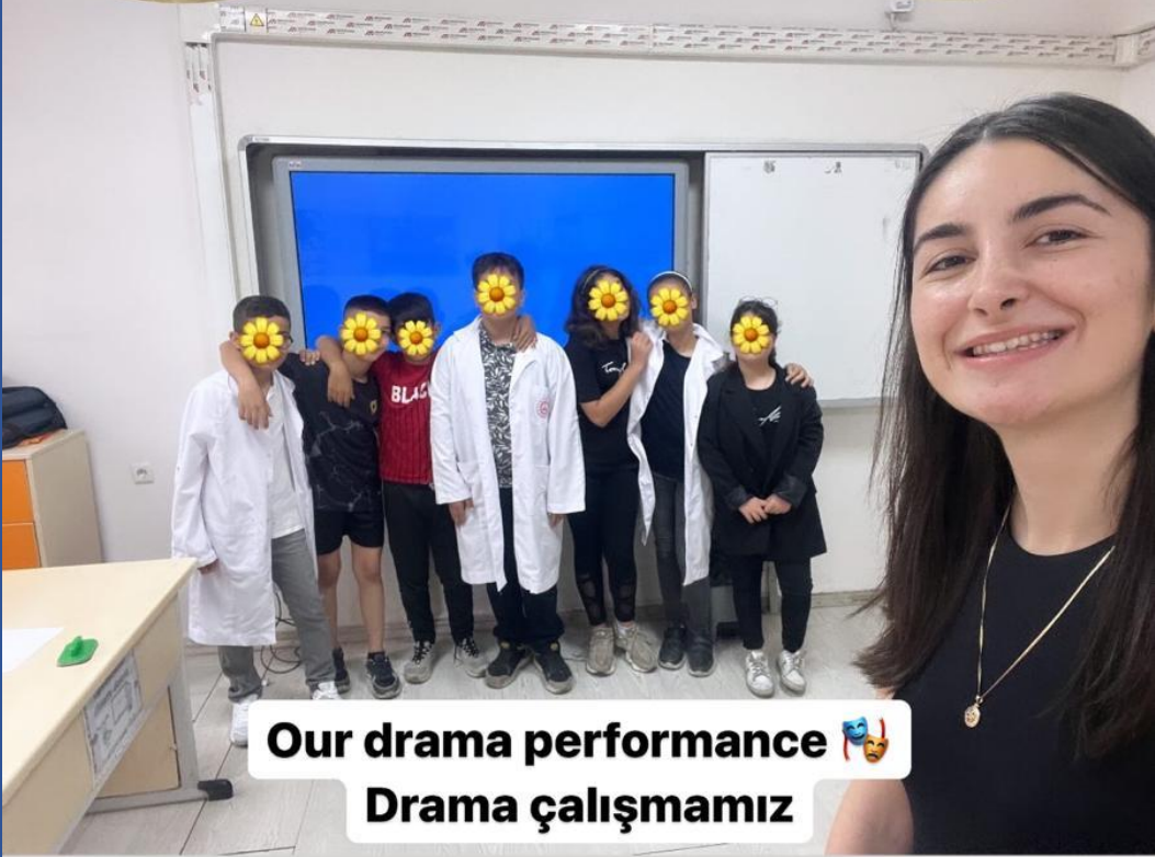
Our drama performance 🤖👤 Drama çalışmamız